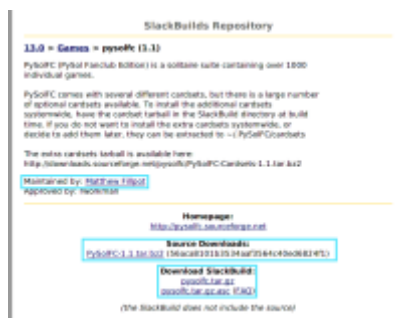
Figure 2 - Pysolfc SlackBuild Page

Now, the next thing you'll need to do is download the source ( PySolFC-1.1.tar.bz2 ) and the SlackBuild ( pysolfc.tar.gz ) into your .build directory (or wherever you want to build your stuff). Untar the SlackBuild script from the command line using this command: